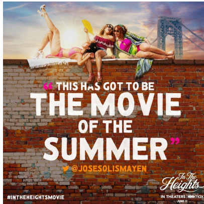
In the Heights